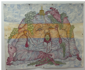
Centerpiece , 2024, pen and watercolor on paper, 40" x 40", $769