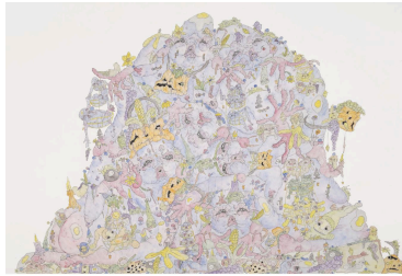
Pineal Pile , 2023, pen and watercolor on paper, 44" x 60", $1,111