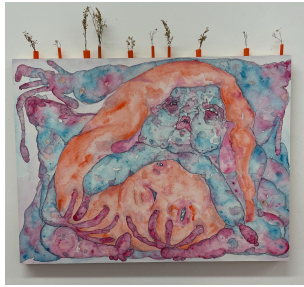
nug I , 2025, 18" x 24", pen and acrylic on paper on panel, $369