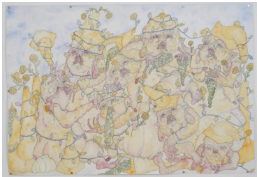
Dunkin' Scrum , 2024, pen and watercolor on paper, 40" x 60", $1,999