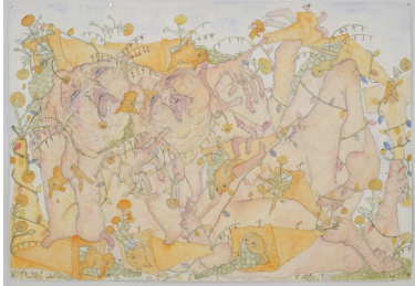
Sacroiliitis , 2024, pen and watercolor on paper, 40" x 60", $1,999