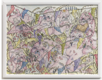
Crabitat , 2023, pen and watercolor on paper, 18" x 24" framed, $469