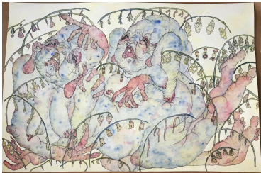
Back Crackle in CMYK , pen and watercolor on paper, 30" x 40", $669