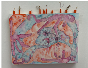
nug III , 2025, pen and acrylic on paper on panel, 12" x 16", $269