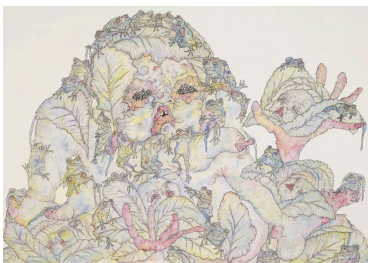
Compost in CMYK , pen and watercolor on paper, 30" x 40", $669