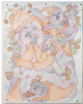
Dunkin' Gnome , 2024, 44" x 30", pen and acrylic on paper, $569