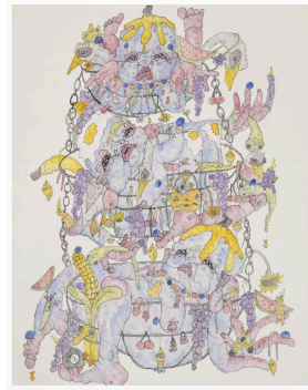
Banana Trinity , 2023, pen and watercolor on paper, 32" x 22", $569