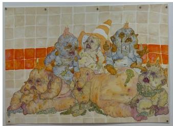
Cohort , 2025, pen, acrylic and watercolor on paper, 30" x 40", $769