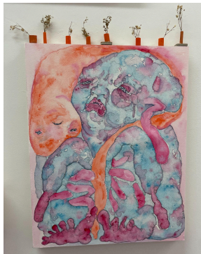
nug II , 2025, 16" x 12", pen and acrylic on paper on panel, $269